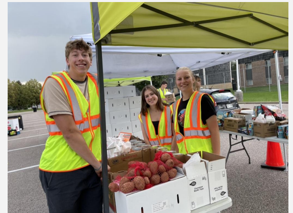
Poudre HS, Putnam and Lopez Food Pantry