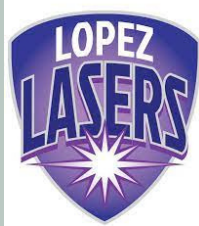
Lopez Elementary School