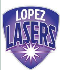
Lopez Elementary School