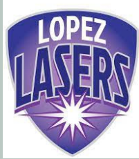
Lopez Elementary School